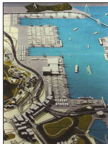
Above: Freight containers at a harbor feature in an 8-foot square example of architectural model making by Gerard Prime and Howard Swales, the partners behind Frontline.

For example, the last model they made was for the Mandarin Hotel in Macao. It commissioned them to produce a life-size model of a 1930s Mercedes racing car to be suspended from the hotel ceiling in conjunction with the Grand Prix.